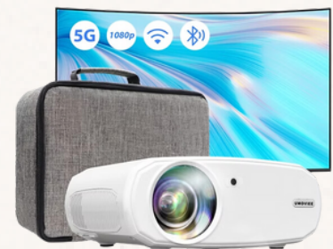
Projector UMOVIEE WiFi/Bluetooth Full HD 1080P, 9500 Lum Value: 25€ + VAT