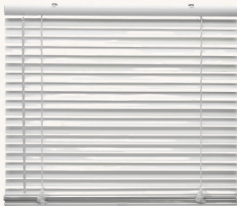
Portable blind for light design Included in the price of the Studio