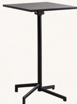
Black table, 60cmx60cm Height: 102cm