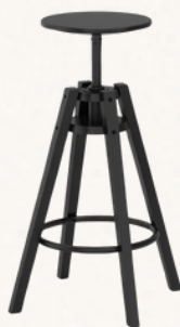
Height-adjustable black seat