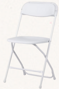
White folding chairs (6x)