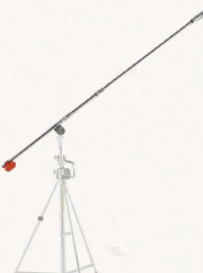
Avenger Junior Boom, w/Built-in Grip Head & counterweight (2x) Studio price: 10€ + VAT External Rental: 15€ + VAT