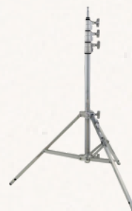
Avenger Baby Stand 30 Silver 300cm Steel Triple Riser (3x) Included in the price of the Studio (External Rental: 15€ + VAT)