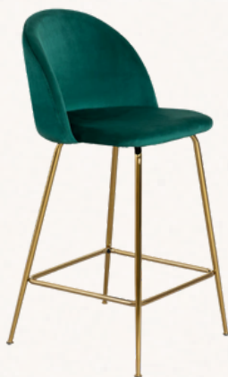
Petrol green velvet high chair with gold feet (x3)