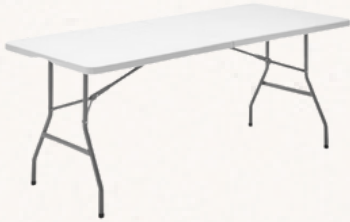
122cm white folding table