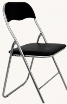
Black folding chairs (6x)