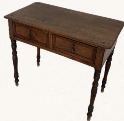
Vintage Commode in Wood (75cm tall)