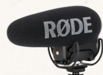
VideoMic Pro+ Premium On-camera Microphone Value: 25€ + VAT