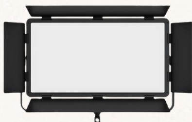
SWIT CL-120D 120W 2:1 Bi- color SMD LED panel light (3x) Studio price: 40€ + VAT External Rental: 60€ + VAT