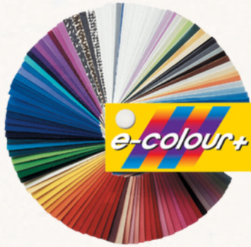
E-Colour+ Sheet Filters (various colours available) Included in the price of the Studio