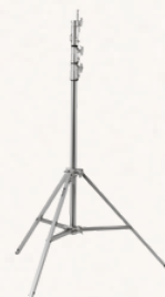
Avenger Combo Stand 35 Silver 350cm Steel Double Riser (2x) Studio price: 10€ + VAT External Rental: 15€ + VAT