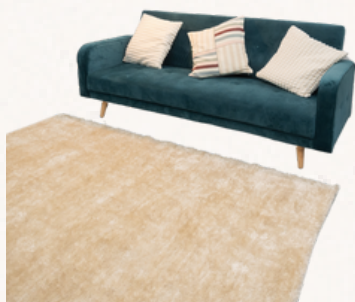
Petrol blue velvet sofa, cushions and beige rug