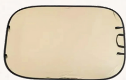
AVENGER I4834 Reflective Display Gold/White 120x90cm Included in the price of the Studio (External Rental: 15€ + VAT)