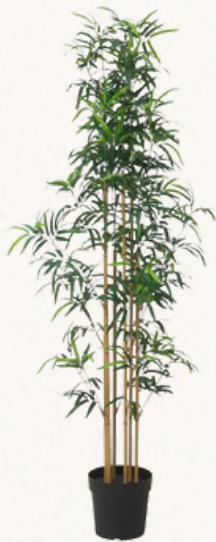
Artificial Bamboo Plant (170cm tall)