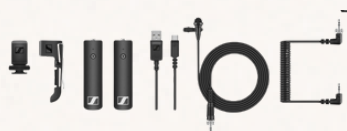
SENNHEISER XS Wireless Digital Portable Lavalier Set Value: 35€ + VAT