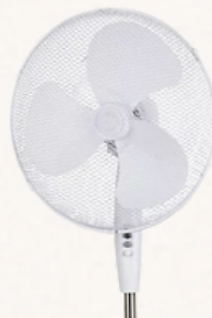
Fan Included in the price of the Studio