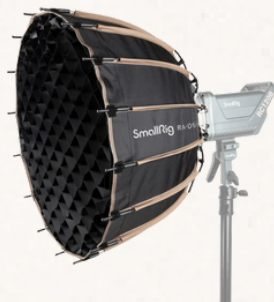
SmallRig 3585 RAD55 Parabolic Softbox (2x) Included in the price of the Studio (External Rental: 20€ + VAT)