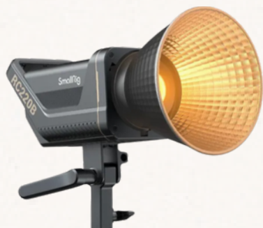
SmallRig 3621 RC220B COB LED Light Bi-Color (2x) Included in the price of the Studio (External Rental: 45€ + VAT)